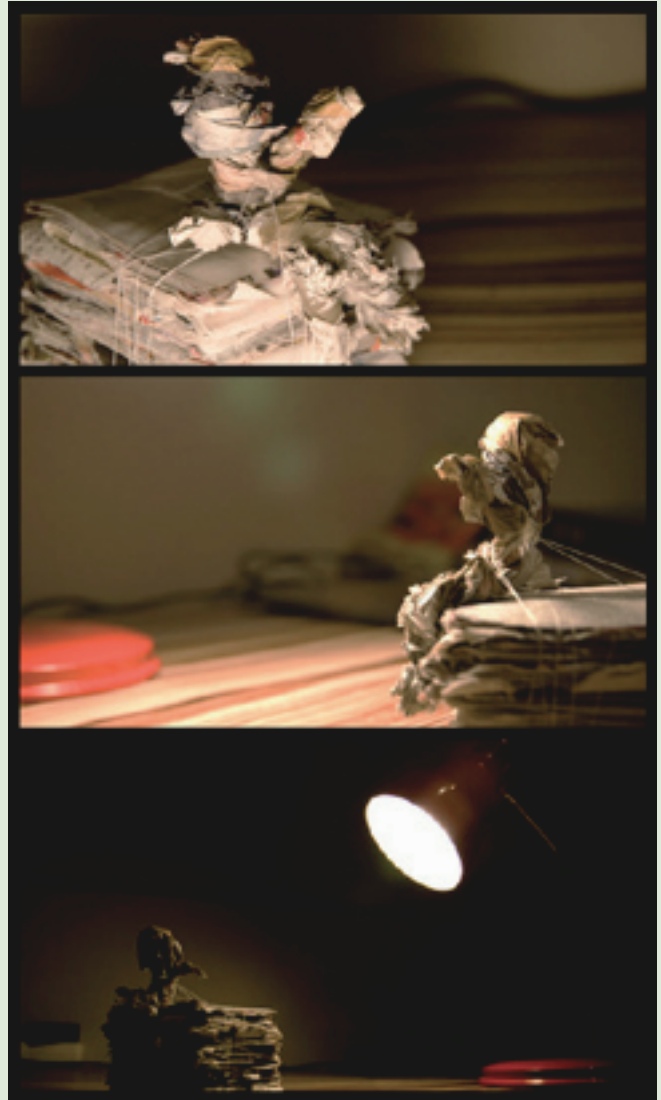
Paper dude, one of the projects finished pieces.