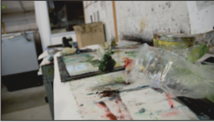
The mess that is left behind after the session.