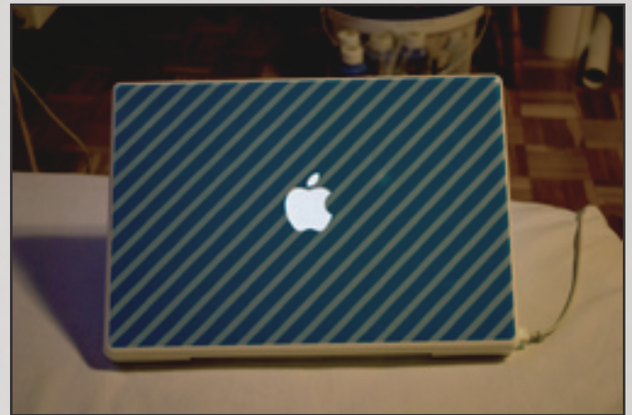
Top: A personalized MacBook to differentiate even between Mac users

up on it probably as much as his drinking of tea. But what makes a Mac really that different than a PC. It is all about the stylish details and design that Apple has put into manufacturing this notebook. The Mac OS X is also a particularly brilliant piece of software. Who ever thought that you do not actually need two buttons to click around your Desktop, well on a Mac one button is enough for everything. There are still plenty of stuff that is interesting and could be told about the Mac. For more information just come and look for yourself in the Apple Store on Regent Street.