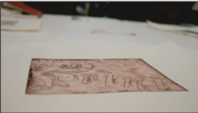
A print exposed.